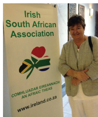
Durban, South Africa

Screening and Discussion, Hosted by the Embassy of Ireland and the Irish South African Association