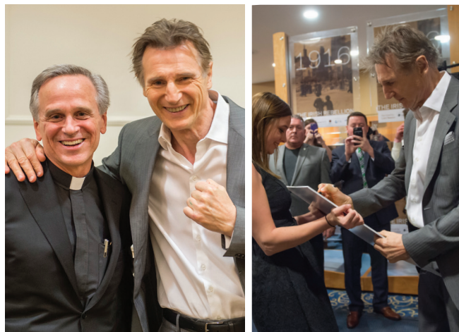
Notre Dame, Indiana

Screening – Universidade da Coruña and Embassy of Ireland