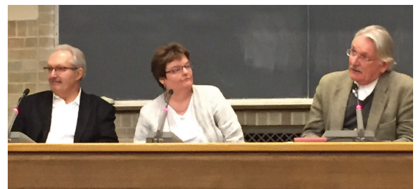
Ann Arbor, Michigan