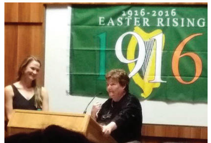
Cape Town, South Africa