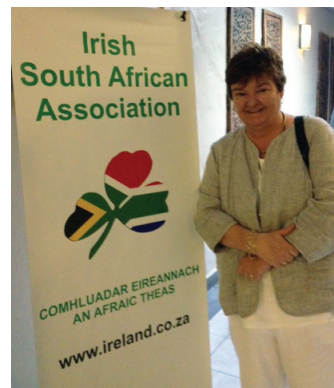
Durban, South Africa