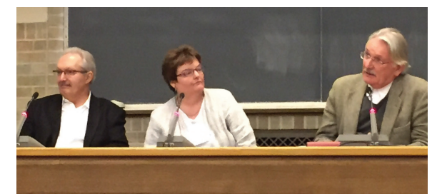
Ann Arbor, Michigan