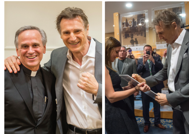
Notre Dame, Indiana