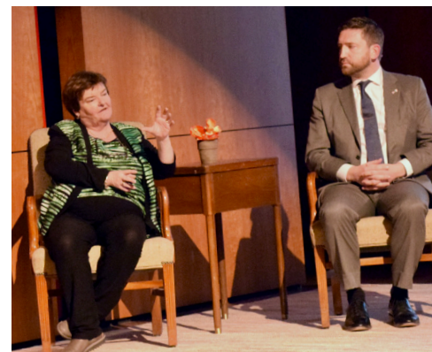
Kansas City, Missouri

Screening and Discussion, Hosted by GPO Witness History